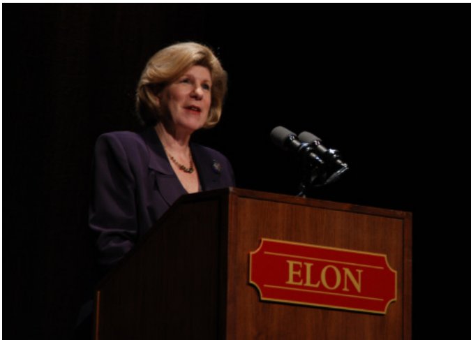
Nina Totenberg , NPR news correspondent, delivered the keynote address at the Elon School of Law in Greensboro.