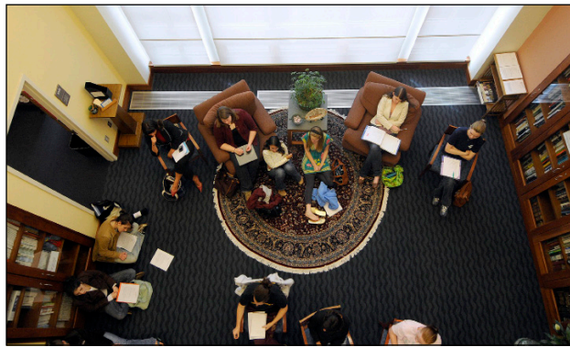
Archives and Special Collections Reading Room.

The Belk Library Archives houses records and materials of Elon University that date back to the founding days of Elon College (1889) and continue into the present. The materials and collections relate directly to the history of the school, the Town of Elon, and surrounding geographical areas. The Archives preserves, collects, maintains, and makes available University records and publications of administrative, fiscal, legal, and historical value. Additionally, the Archives collects personal papers, pamphlets, booklets, articles, printed materials, photographs, and much more that relate to alumni, faculty, staff, and students of Elon. Please contact the Archivist and Special Collections Librarian for additional information about the use, reproduction, and general inquiries regarding the archives.