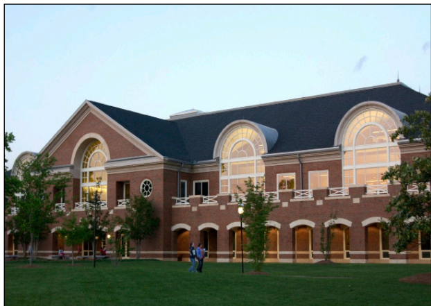
Carol Grotnes Belk Library located at Elon University.

The Archives and Special Collections Department of Belk Library serves Elon University and the Elon community by the preservation and administration of manuscript collections, special collections, and institutional materials. The primary purpose of the Archives and Special Collections Department is to collect, maintain, preserve, and make available institutional materials of administrative, fiscal, legal, and historical value. In addition, the Archives and Special Collections Department serves as a repository for manuscript collections, printed materials, photographs, artifacts, and other memorabilia that relate to the history of Elon University.