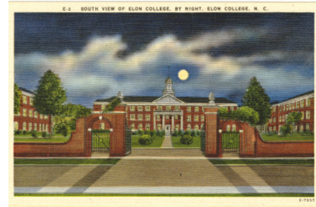
A postcard showing Alamance Building.