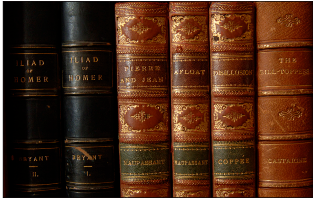
Books from the Williams-Honeycutt Rare Books Collection.

The Special Collections collects, preserves, maintains, and makes available a variety of collections and their materials. Most of the items in the Special Collections are books, but a few collections include photographs, personal papers, audio-visual materials, and artifacts. Please contact the Archivist and Special Collections Librarian for additional information about the use and general inquiries regarding special collections. Visit the Special Collections website for more information http://www.elon.edu/e-web/library/libraryinfo/collections.xhtml .