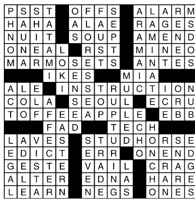
Answers from September 7 issue.