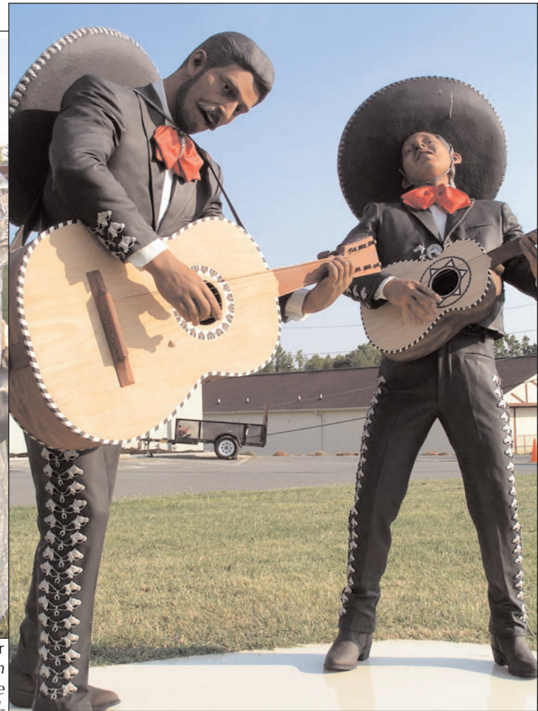
Statues across Alamance County, including the man playing the guitar on Elon's campus, (left) commemorate the 50 years the Alamance County Arts Council has dedicated to the arts.