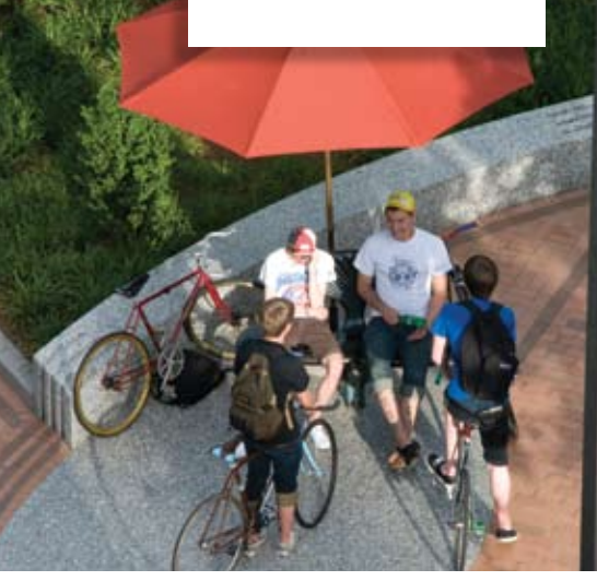
Opposite page: Proposed map of Downtown Greenway. This page: Center City Park event, cyclists at Center City Park

Action Greensboro is a nonprofit organization of foundations and the business community dedicated to projects that enhance business recruitment efforts and community vitality in Greensboro. Project focus areas are: center city, higher education, public schools, and young professionals. For more information, go to actiongreensboro.org.