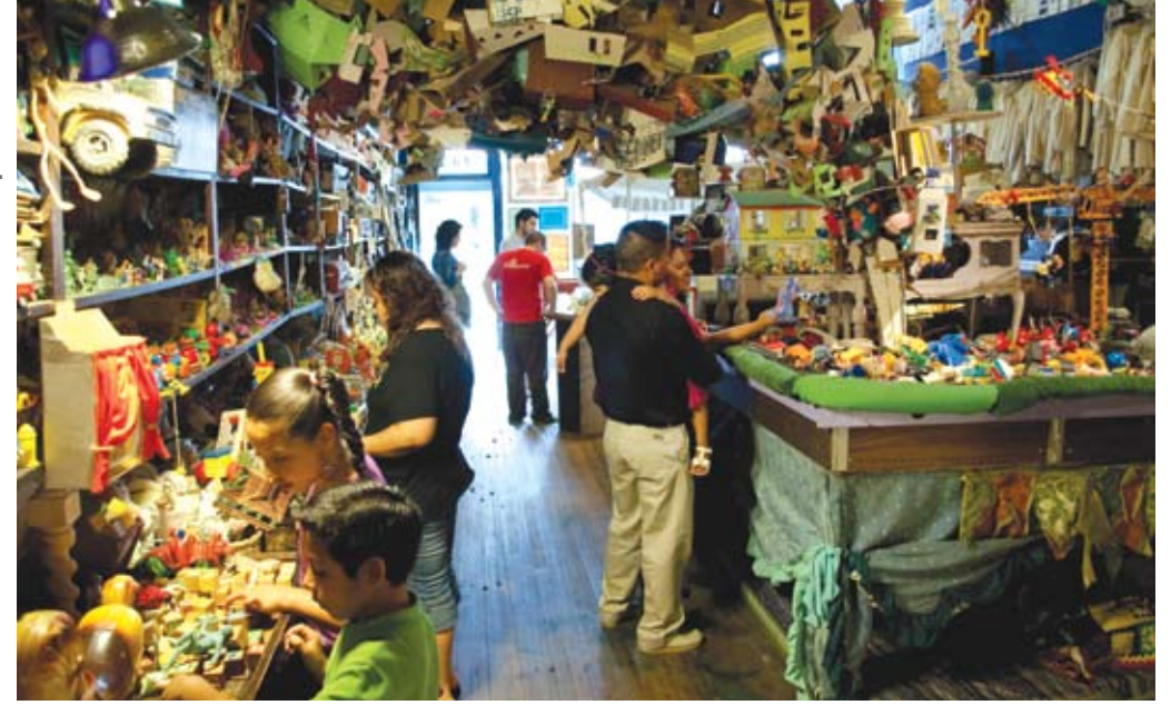
Celebrate Greensboro Art. Culture. Entertainment.