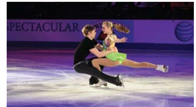
Premier events include the 2011 U.S. Figure Skating Championships.

The facility is expected to operate 15 hours a day, 360 days a year, while packing local restaurants and hotels with swim-meet competitors and their families. In addition,