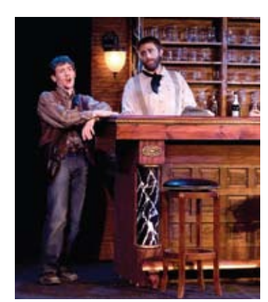
From left: The Face on the Barroom Floor and Write Your Own Opera contest winner

s Greensboro a large enough city to support and sustain a quality opera company? The answer is a resounding yes!