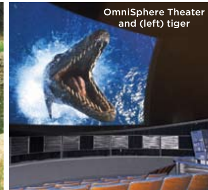
OmniSphere Theater and (left) tiger