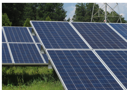
The solar panels at Loy Farm are one example of how Elon strives to be more sustainable.